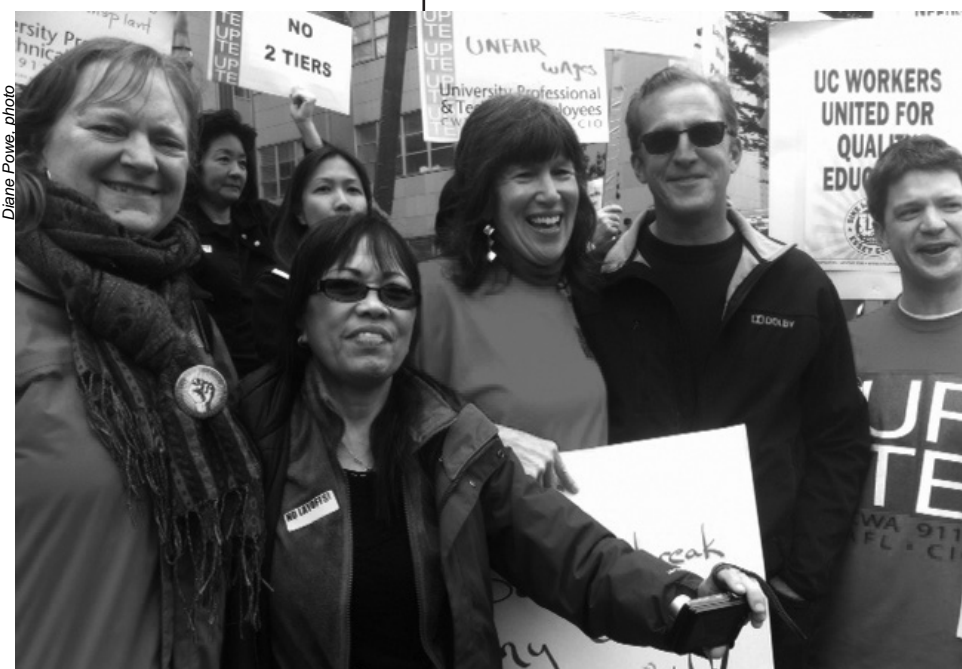
UPTE health care professionals demonstrate at UCSF's Parnassus campus April 4.