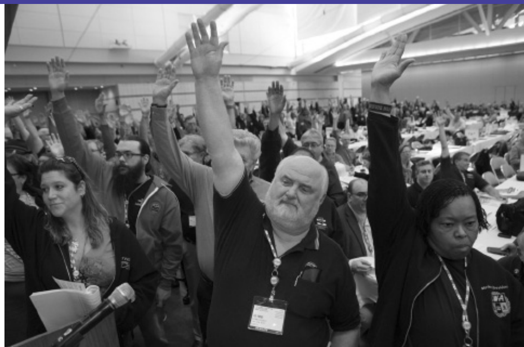
Delegates vote at CWA's national convention in Pittsburgh last month.