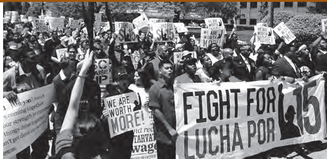
Tens of thousands of low-wage workers have been organizing across the nation for collective bargaining rights and an increase in the minimum wage under the "Fight for 15" banner.

"The resulting crash in morale at LLNL was deep and profound," he added,