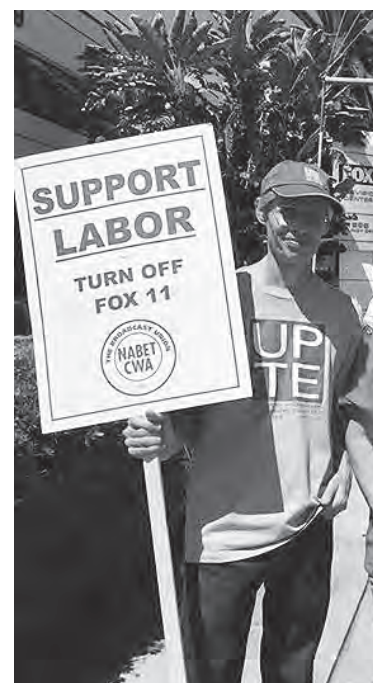
UPTE is a Fox 11

Lesson: don't hesitate to call your local UPTE chapter when you have a question or need assistance.