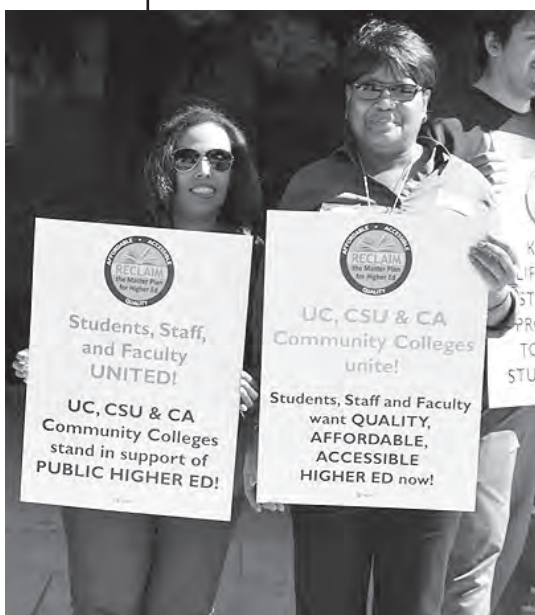
Working to support higher education, including UC, in the state of California.