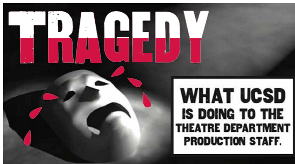
At right, one of the graphics Theatre workers used to get their message across to the public after management announced layoffs.

Lesson: organizing works. If you are threatened with layoffs or "restructuring" in your department, talk to your coworkers and contact UPTE immediately.